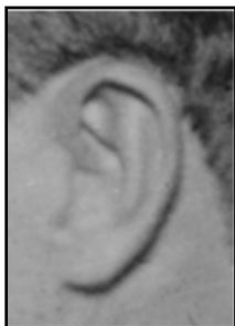
from Photo #2

The ears above are quite different. Hence Photo #1 cannot be Joe Tinker. Let's now compare the left ear in Photo #1 to the left ear, below right, belonging to another Chance-era Cub: