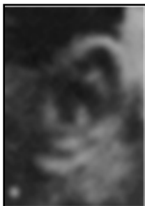
from Photo #1

Let's zoom in on the left ear of both images and compare: